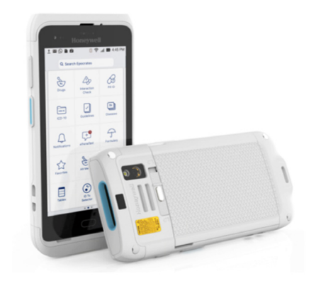
The CT40 XP HC: an essential, connected, all-purpose clinic mobile device that designed for hours of comfortable, productive use without sacrificing functionality, performance and ruggedness.

Data security is everyone's concern. The CT40 XP HC is built on the Mobility Edge platform, a stabilized, locked down, certified integration of software, memory, communications and CPU that enables best in class lifecycle, OS updates and security. The best way to optimize security is to use the most recent version of Android. The CT40 XP HC comes with guaranteed compatibility with Android 11 (R), with Honeywell's commitment to support Android 12 (S) and 13 (T), subject to feasibility. In addition, the CT40 XP HC is compliant with the FIPS 140-2 Level 1 security requirements to protect patient data – the highest level of data security in its class.